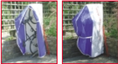
NOW YOU SEE IT, NOW YOU DON'T: A BikeAway With Cover in a garden and (below) a Double BikeAway