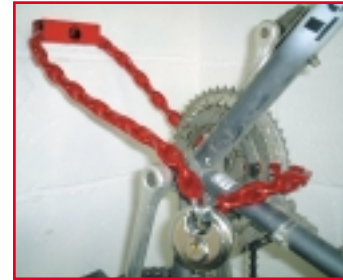
STANDING CONVENTION ON ITS HEAD: A Wall-Hoop BikeAway (left) with Chain Holder holds a bike securely up against a wall. The patented Chain Holder (above) lets you bolt a chain to any wall – and when the chain's in place, no-one can get at the bolt to remove the holder! The Free-Standing BikeAway (below) has already proven itself at the St Ives (Plymouth) printing and publishing premises, where 15 bikes can now be parked comfortably in a space that used to take only eight bikes in an untidy heap!